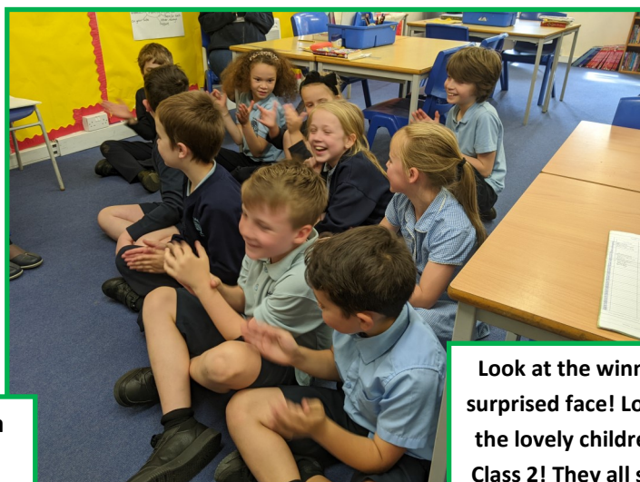
Look at the winner's surprised face! Look at the lovely children in Class 2! They all seem really happy for her.